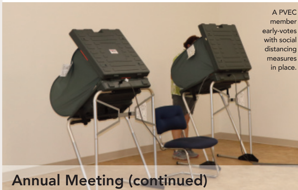
A PVEC member early-votes with social distancing measures in place.

Write a review. Get on Yelp and on the website of your favorite businesses and talk them up. Online reviews go a long way toward attracting customers. It will take you just a minute to post a rave review that might just save someone who lives in your community from shuttering a neighborhood institution.