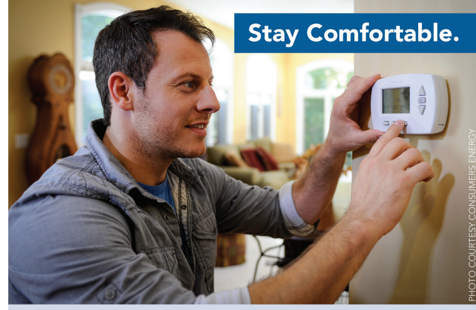
Space heating and cooling account for a large portion of the average home's energy use. A programmable or smart thermostat can help you control the temperature of your home and save energy.

Most of us spend very little time thinking about our thermostats, but they can have a significant impact on your comfort and your energy bill. We're always available to help you make smarter energy choices.