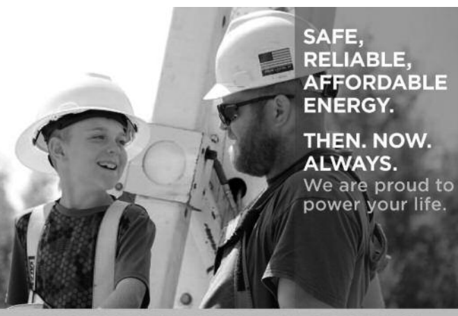
OCTOBER IS NATIONAL CO-OP MONTH